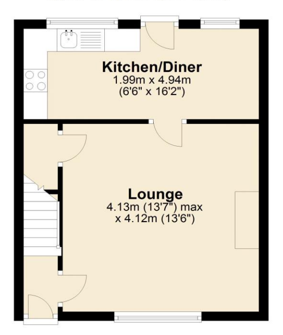
Ground Floor Approx. 30.7 sq. metres (330.7 sq. feet)